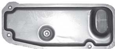
72603 3/4" Pickup Inlet