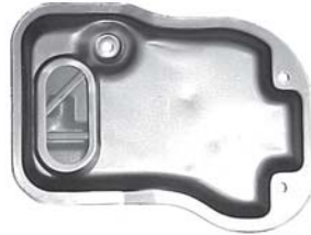
72600L Similar to 72604, 72605 & 72605B Note Differences in Pickup Area