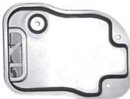
72605 Similar to 72600L, 72604 & 72605B Note Differences in Pickup Area