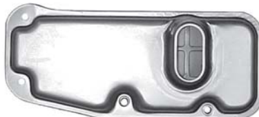
72603A Similar to 72601B with Different Mounting Holes