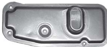
72601B Similar to 72603A with Different Mounting Holes