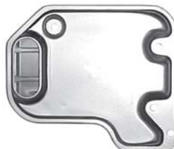
72605B Similar to 72600L, 72604 & 72605 Note Differences in Pickup Area