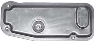
72601A 1/4" Pickup Inlet